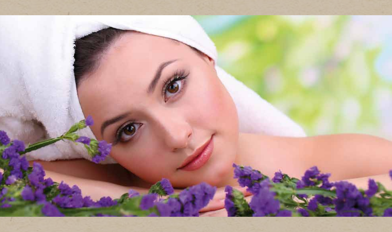
Beauty treatments and hair removal